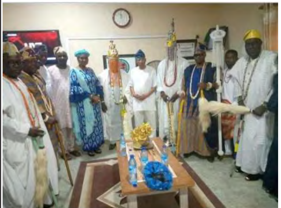
The newly installed Kings in Badagry with the Badagry LG chairman and other chiefs