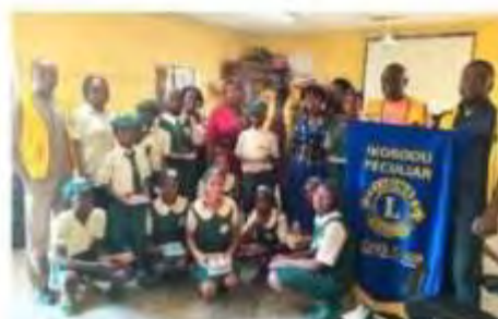
Ikorodu lions club presenting awards

Ikorodu Peculiar Lions Club has engaged the students of Ayangburen Junior High School in Ikorodu on their grammatical knowledge of the