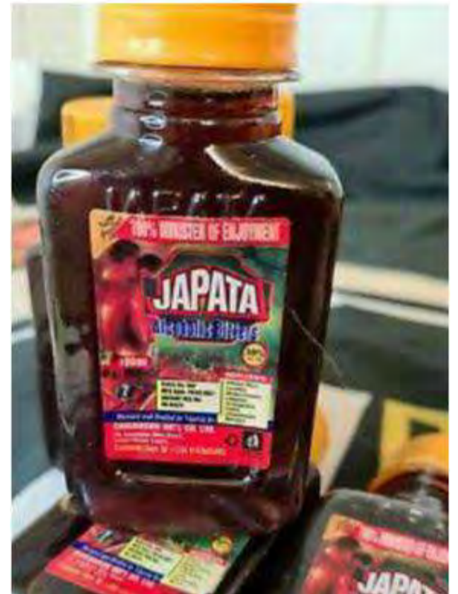
Japata Alcoholic drink

"Through intelligence, NAFDAC was able to