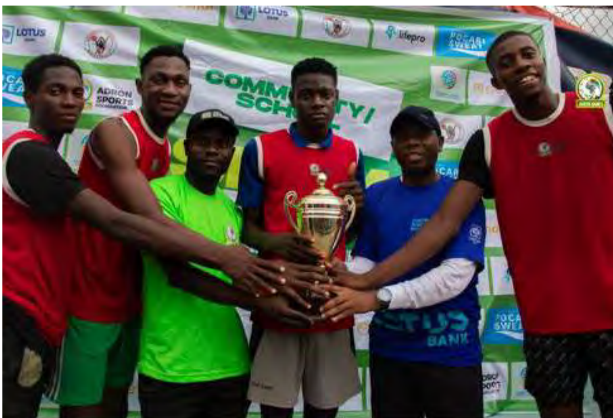
Adron Sports Foundation basketball tournament

O ver 50 teams were invited to partake in the Adron Sports Foundation community/schools slam and dunk