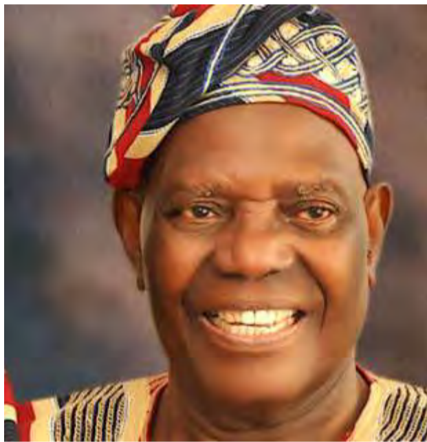
Chief Bisi Akande

Chief Akande is a political icon, known for his honesty, transparency, discipline, knowledge, and visionary