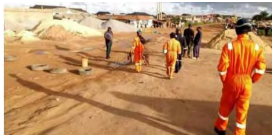
Vandalized scene in Igando Ikotun

Lagos State Emergency Management Agency (LASEMA) has allayed the fear of the residents of the Ijedodo community over the vandalism of a petroleum pipeline in the community, assuring them of safety.